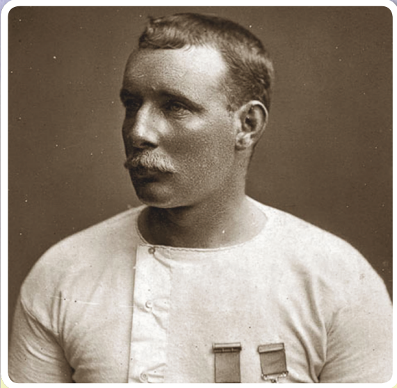
Swimming the English Channel