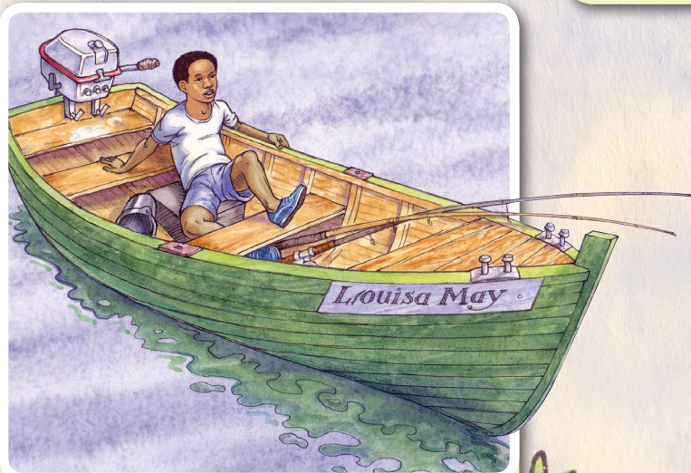
An Encounter at Sea