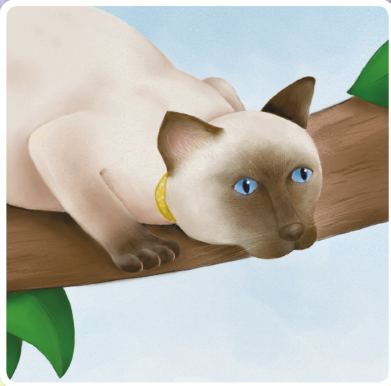
Gaby to the Rescue