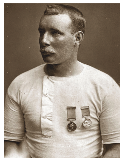
Captain Matthew Webb

Many of the hardships that Matthew Webb had to deal with during his pioneering swim are still faced by modern-day Channel swimmers. In fact, some of his methods for dealing with these hardships are still used today. Webb coated himself in oil for protection against the cold and jellyfish stings. He was also accompanied by boats so his friends could protect and feed him. It must be said, however, that the ale, brandy and beef tea they supplied are not standard for today's cross-Channel swimmers!